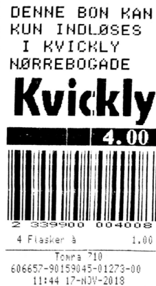
Fig. 1: An example of a voucher printed by a Tomra T-710 machine

From a security perspective, Tomra has filed several patents for detecting fraud attempts in reverse vending machines [12,17,7]. However, the effort is almost exclusively concentrated on making sure that the machine does not accept invalid containers. Thus, we can assume that no RVM would accept an invalid container. Such an assumption can be confirmed by our observations of the machines. In particular, we had access to look through one of the Tomra RVMs while being emptied from its containers.